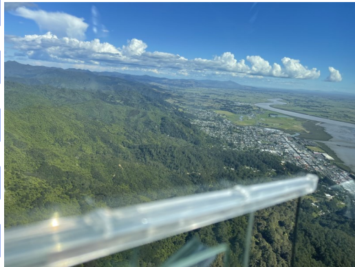
Thames away trip.