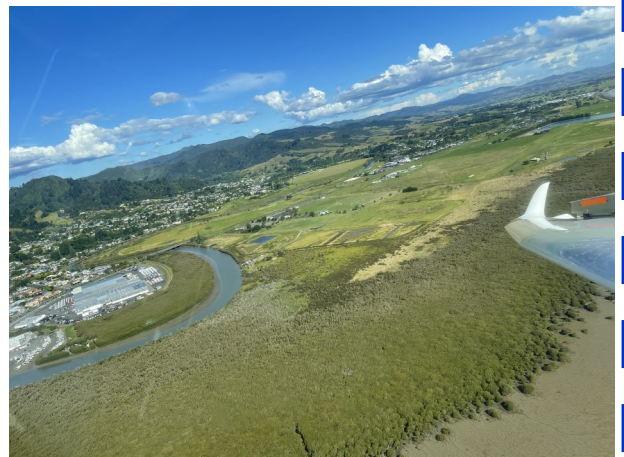
Thames right base 14