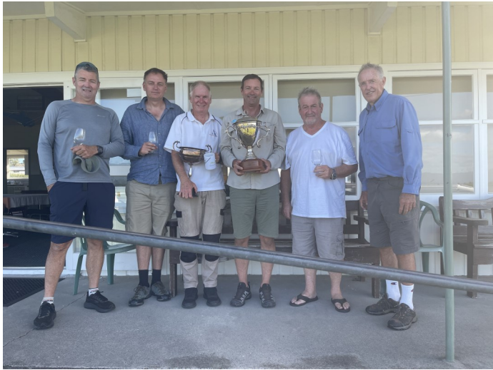
GNZ Grand Prix podium finishers.