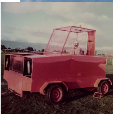
The old winch, as it was in 1977.