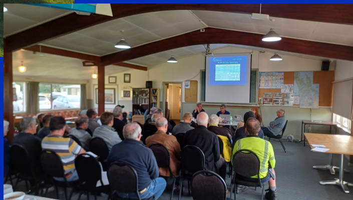
PGC AGM 5th July