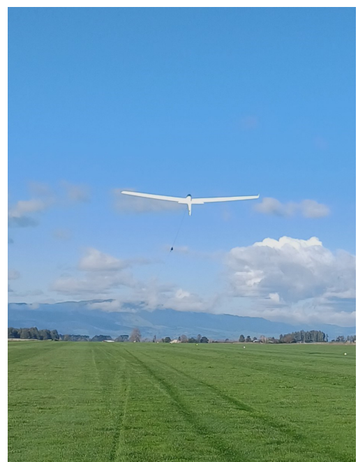
Chris Money in 'I'm ready and waiting' mode on our rebuilt winch. 21st June