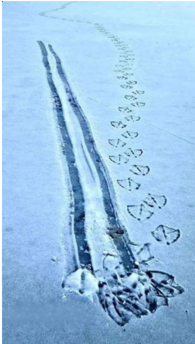
Wheel brake doesn't work too well in the wet.