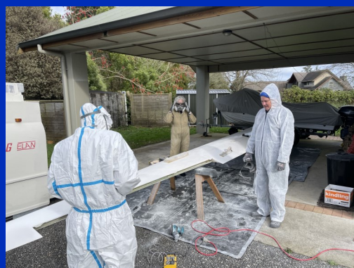
Above - What do you do if your glider needs a repaint? Team GNV in action. 6th July