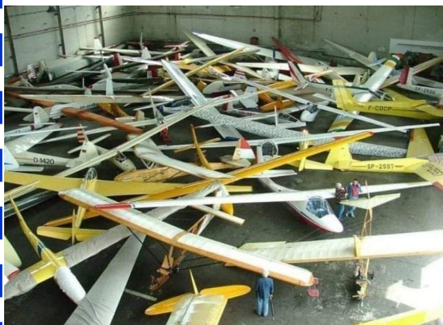
Left is at a VK meet in Poland early 2,000's. The gentleman with the umbrella is probably contemplating how to get out his glider from the back corner.