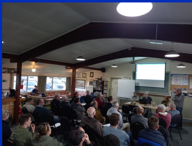
The Bristell 915 iS LSA tow plane. Details on page 8

Well attended (34) 2023 PGC AGM. All the sausage rolls were consumed and none burn't. 1st July