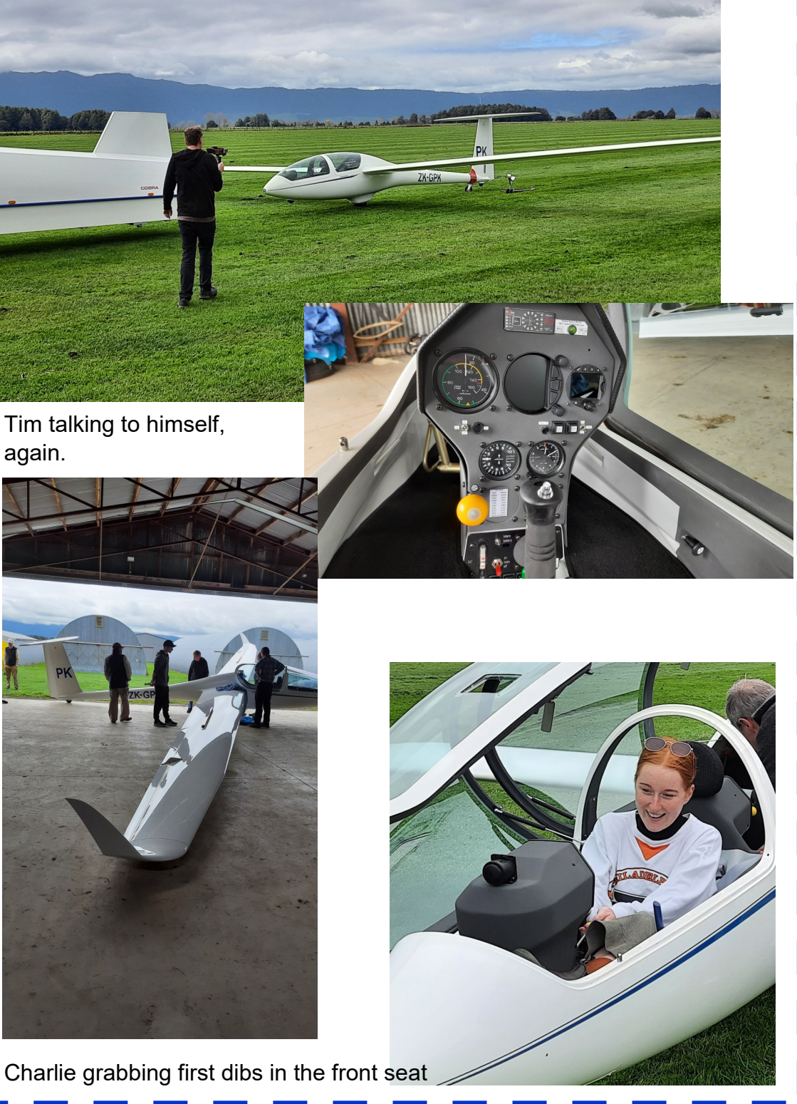
Day 1 PK Snippets 24th August

DELIVERING HIGH QUALITY GLIDING OPPORTUNITIES TO MORE PEOPLE