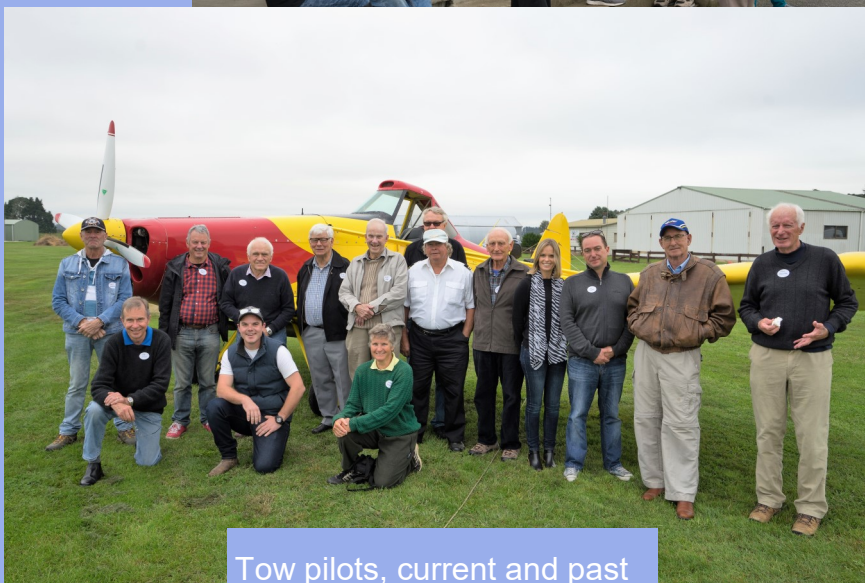
Tow pilots, current and past