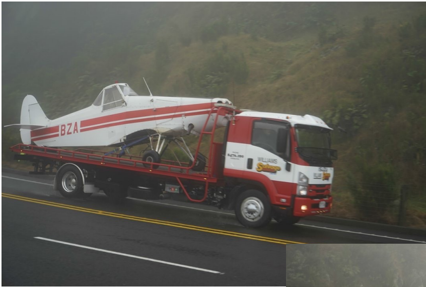
BZA's recent transport from Tauranga. Wings are in the club hangar and the fuse is at Hamilton