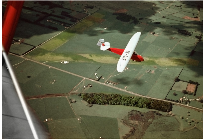
1956 with airfield in the background