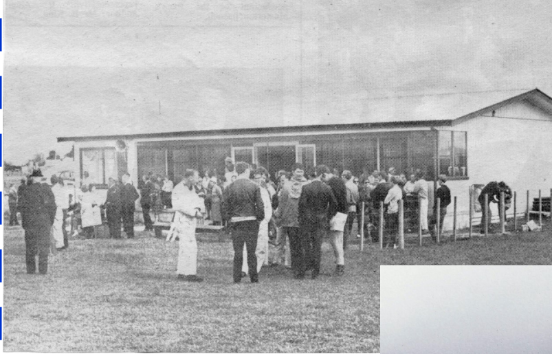
SPECTATORS outside the Matamata Soaring Centre's new $10,000 club house which was opened at Matamata Aerodrome last Saturday. 28/10/64