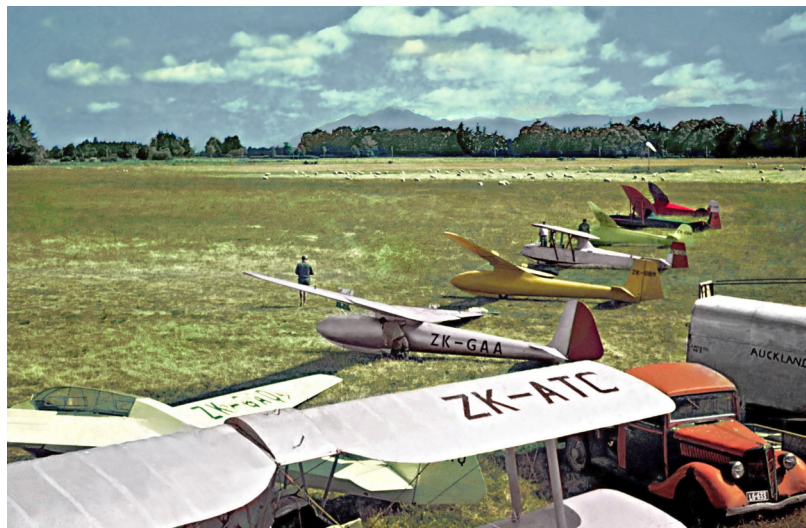
1956, outside the hangar. Te Aroha in the background