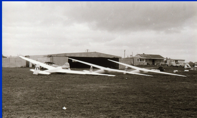
1969 above and 1997 below