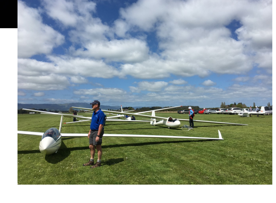
The grid 4th Oct