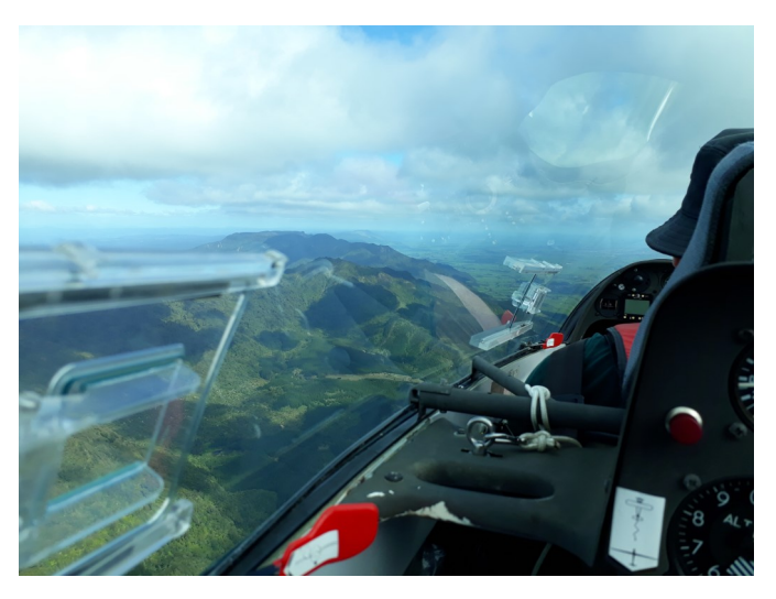
YL 4th Oct