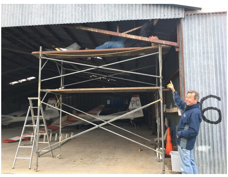
Someone lying down on the job