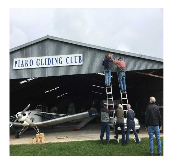
Starling box 2. Only 8 to go