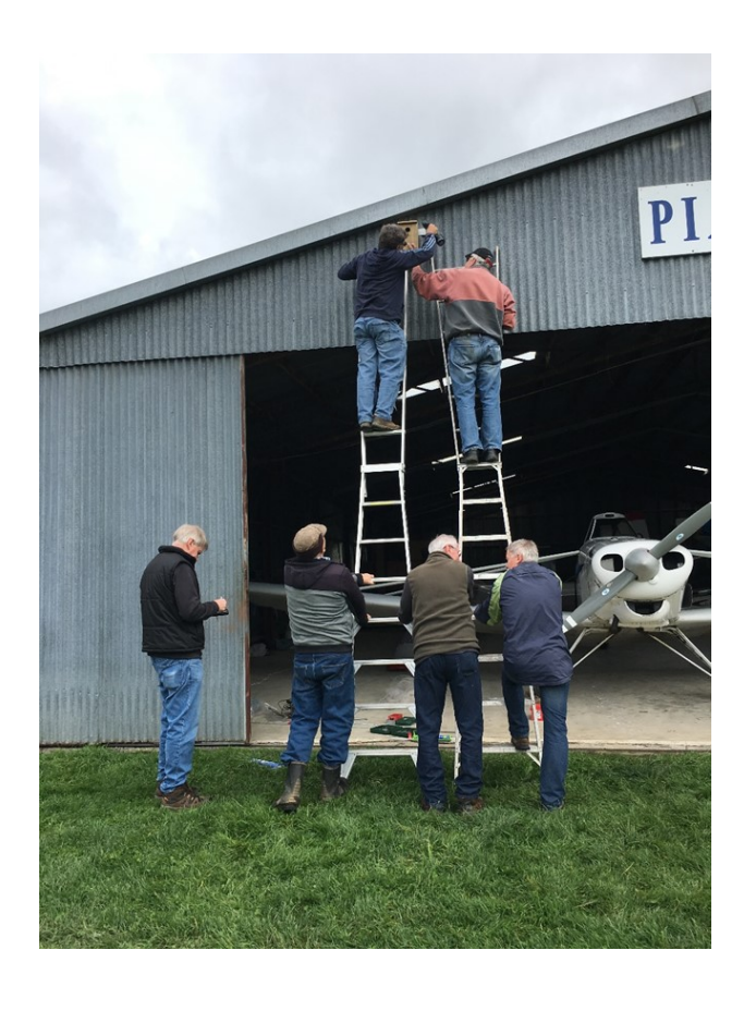
Starling box no 1